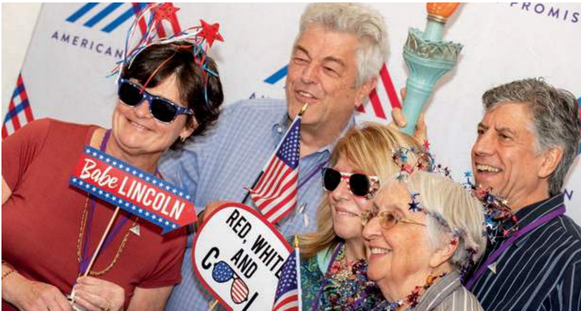
National Citizen Leadership Conference, October 2019.