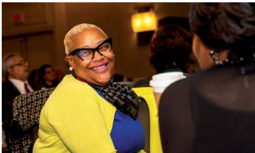
National Citizen Leadership Conference, October 2019.