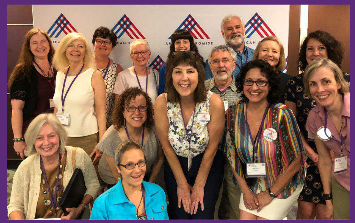
Citizen Leaders at the 2018 National Citizenship Leadership Conference

Inspired? Join us: http://www.americanpromise.net