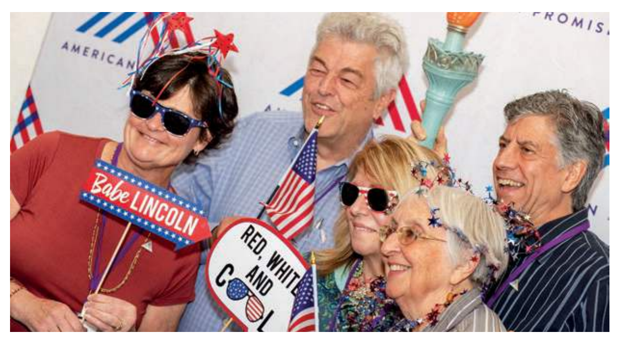
National Citizen Leadership Conference, October 2019.